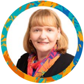
Stephanie A. Urchick Rotary International President