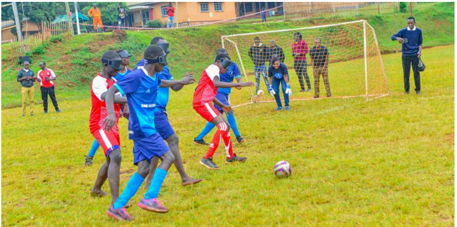
Players in the Blind Football Uganda league have found new opportunities through the sport.

Because members are spread around the globe, the club began dividing into smaller clusters that meet by time zone and language. Members support each other on a wide range of conditions, including some that are less recognized as disabilities.